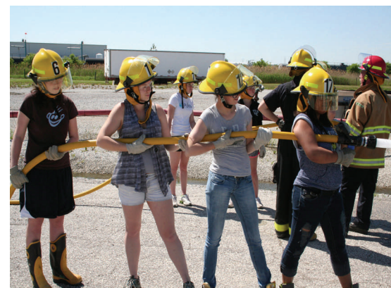
Hands-on activities at the Fire school

The Girls in Gear event will return in 2012.