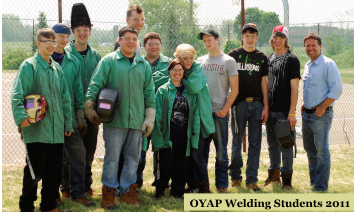
OYAP Welding Students 2011

“My OYAP experience has definitely changed my opinion about attending college/apprenticeship training. After completing this program, I know that I am going to finish my apprenticeship training in order to become a fully licensed professional hairstylist”