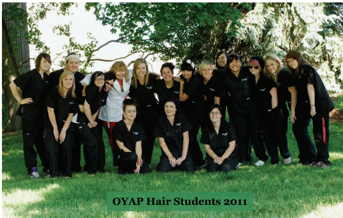
OYAP Hair Students 2011

“My OYAP experience has definitely changed my opinion about attending college/apprenticeship training. After completing this program, I know that I am going to finish my apprenticeship training in order to become a fully licensed professional hairstylist”